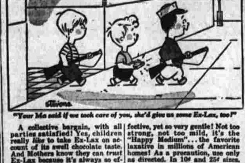
Drug Store illustration.